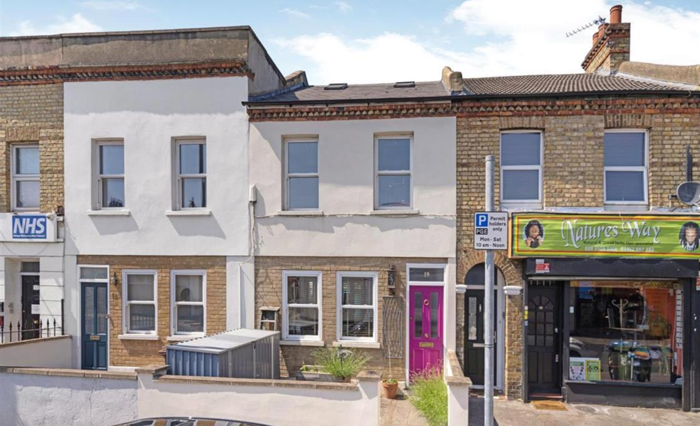
4 bedroom terraced house for sale £675,000 London